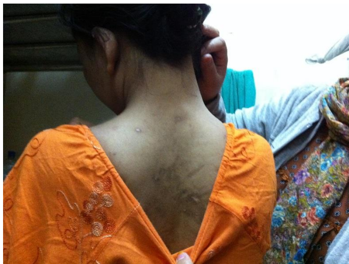
An Indonesian former domestic worker shows researchers the marks on her body that she said were inflicted by her employer.